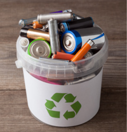
No batteries, motor oil, paint or fluorescent tubes in the trash.