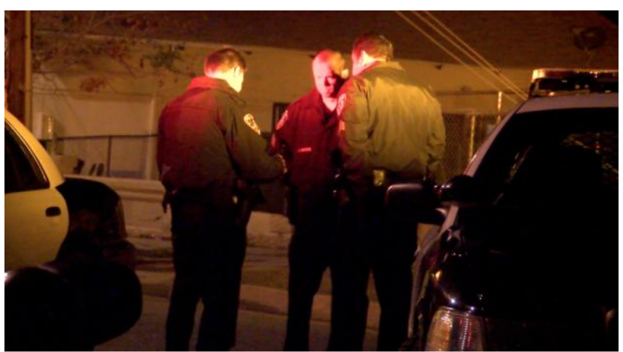
Riverside police early Saturday morning investigate a shooting. A police officer shot a man to death late Friday who had opened fire on him, police said.

What's new: Man killed by officer identified