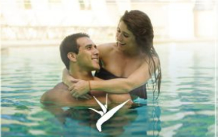
GLEN IVY HOT SPRINGS Elevating Life Experience Since 1860