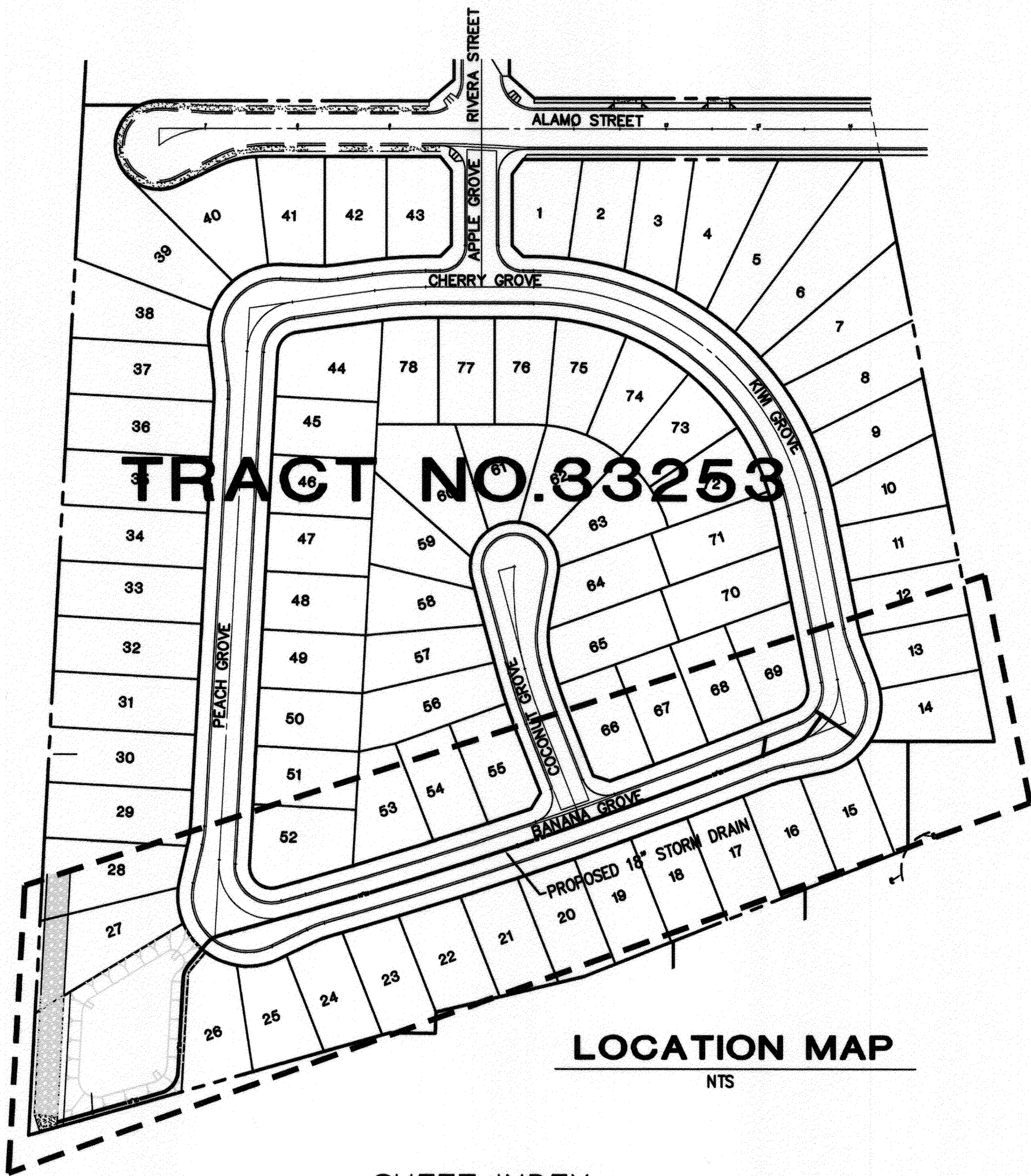
LOCATION MAP NTS