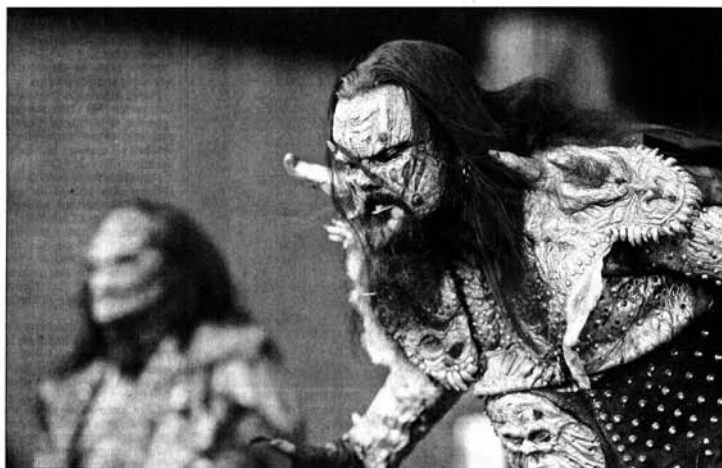
The lead singer of Finnish hard rock group Lordi, known as Mr. Lordi, poses for the crowd at Ozfest on Saturday at Hyundai Pavilion in Devore. The 2006 Eurovision Song Contest winners provided a rousing start at the main stage.

Static X emerged as the real stars this year. The industrial