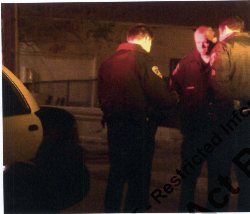
Riverside police early Saturday morning investigate a shooting death late Friday who had opened fire on him, police said.

What's new: Man killed by officer identified