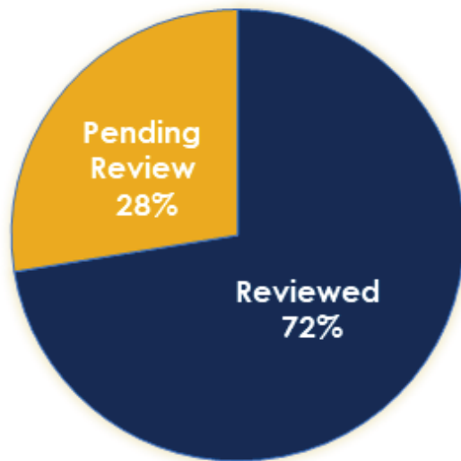
Figure 2 illustrates the 39 allegations logged from the 21 cases reviewed by the Commission.

Below, Figure 1 identifies the cases reviewed in 2020 vs. the cases remaining for the Commission's review by the end of 2020.