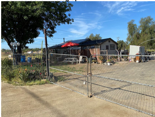
Façade with obscured entry and north elevation, view SW DPR 523L (1/95)