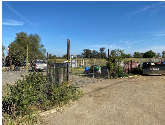
Yard, debris, and field beyond, view NW